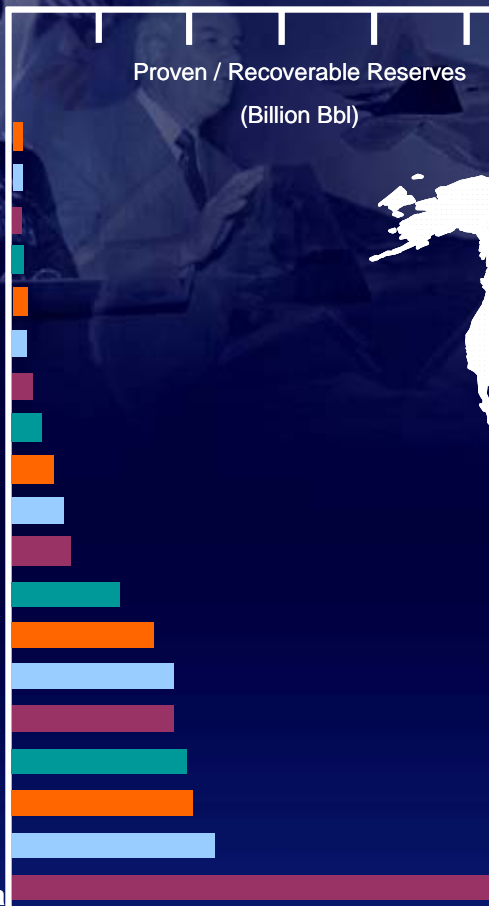
OPEC Flows of Crude and Refined Oil, 2005

Usbekistan Australia Malaysia Canada Kazakhstan Algeria Indonesia Norway Mexico China Nigeria Libya USA Russia Venezuela Qatar Iran Kuwait UAE Iraq Saudi Arabia