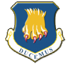
Senior Officer Quarters Area ADP